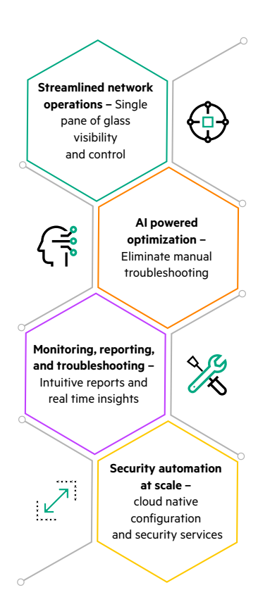
Figure 1. Key features of HPE Aruba Networking Central